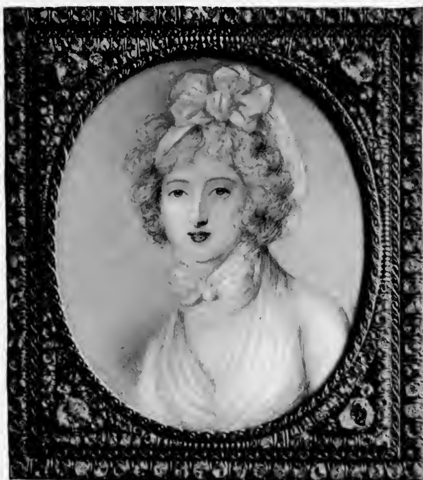
HENRIETTA, LADY DUNCANNON AFTERWARDS COUNTESS OF BESSBOROUGH (Ob. 1821) BY RICHARD COSWAY R.A.